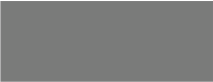
RAL 7037 - grey