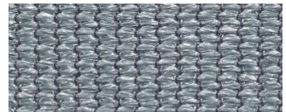
Silver RAL 7000 - 87% SHADE