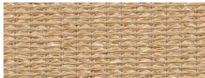
Beige RAL 1001 - 79% SHADE