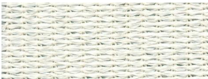
Ivory RAL 1014 - 76% SHADE