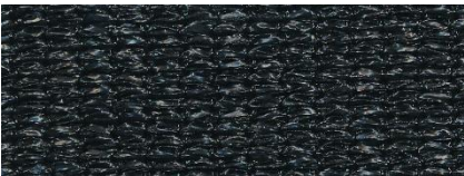
Black RAL 9005 - 97% SHADE