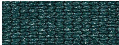
Dark green RAL 6005 - 88% SHADE